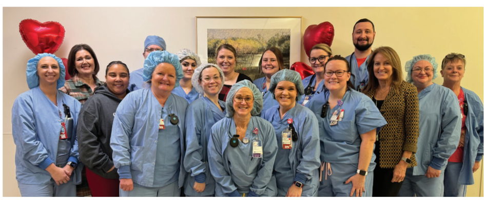
The Top-Rated Trinity Cardiac Team celebrated its 700th TAVR (Transcatheter Aortic Valve Replacement) on January 8, 2025.