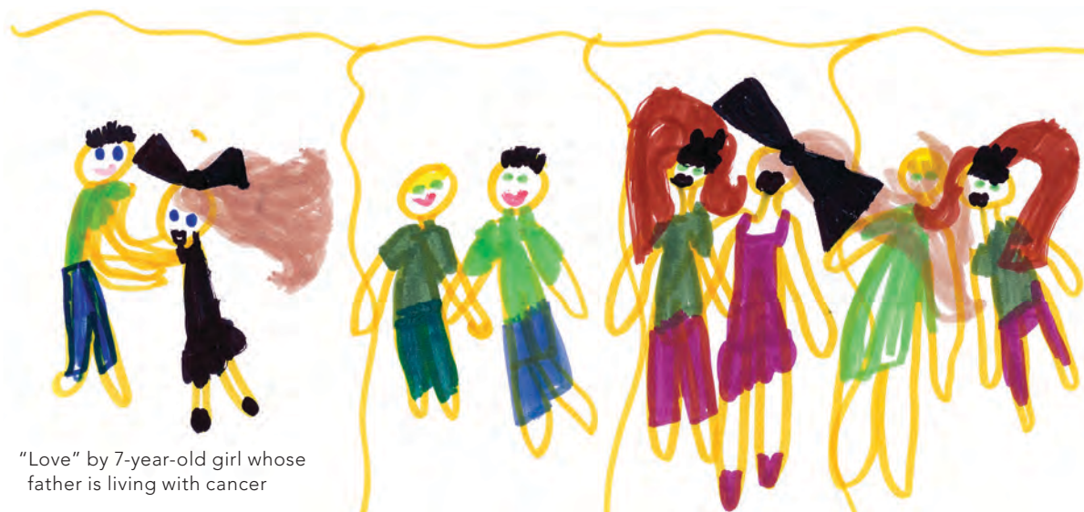
"Love" by 7-year-old girl whose father is living with cancer

66% OF PARENTS ANSWERING A CANCER SUPPORT COMMUNITY SURVEY SAID THAT THEIR CHILD(REN) DID NOT TALK OPENLY WITH THEM OR SHARE THEIR FEELINGS ABOUT CANCER.