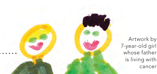
Artwork by 7-year-old girl whose father is living with cancer