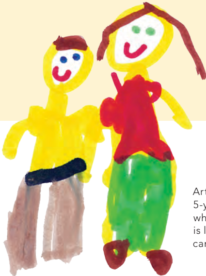
Artwork by 5-year-old boy whose father is living with cancer

"Magical thinking": Thinking they did something to cause cancer (e.g., "I wouldn't go to sleep and kept Mommy awake. She was very tired and I think I made her sick.")