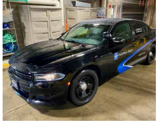
Campus Security Car