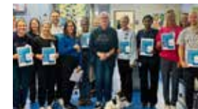
4 West, Physical Medicine & Rehab and Pet Therapy Volunteers Guardian Angel presentation