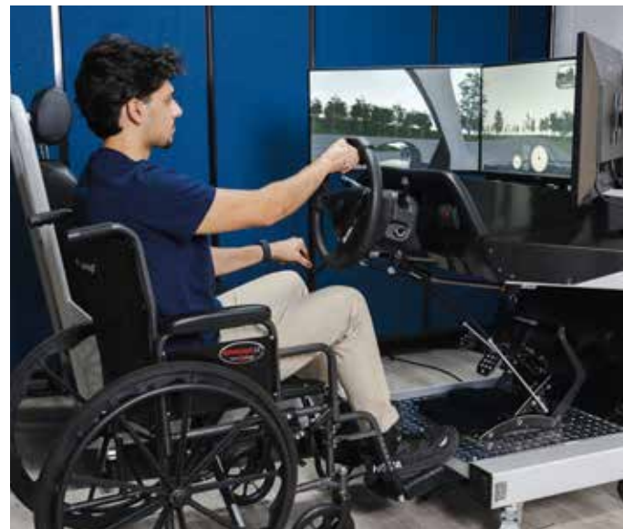
STISIM Drive G4 simulator