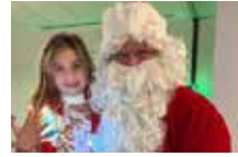
Helen G. Nassif Community Cancer Center Children's Holiday Celebration