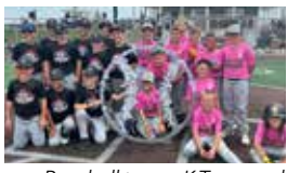
Baseball teams K-Town and E IA Thunder at the Fighting Cancer Together Baseball Tournament