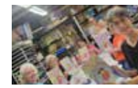
Helen G. Nassif Community Cancer Center Creative Art Session with DKW Art Gallery