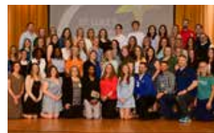
Patient Care Excellence Award and Scholarships