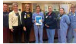
Birth Care Center Guardian Angel ceremony