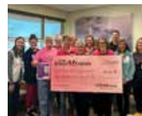
Team Breast Friends 2025 Check Presentation