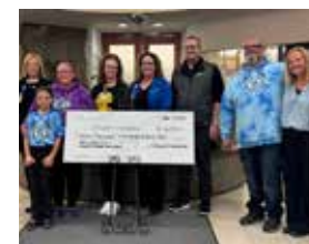
LT Memorial Foundation 2025 check presentation