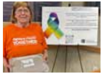
Helen G. Nassif Community Cancer Center Survivor's Month celebration