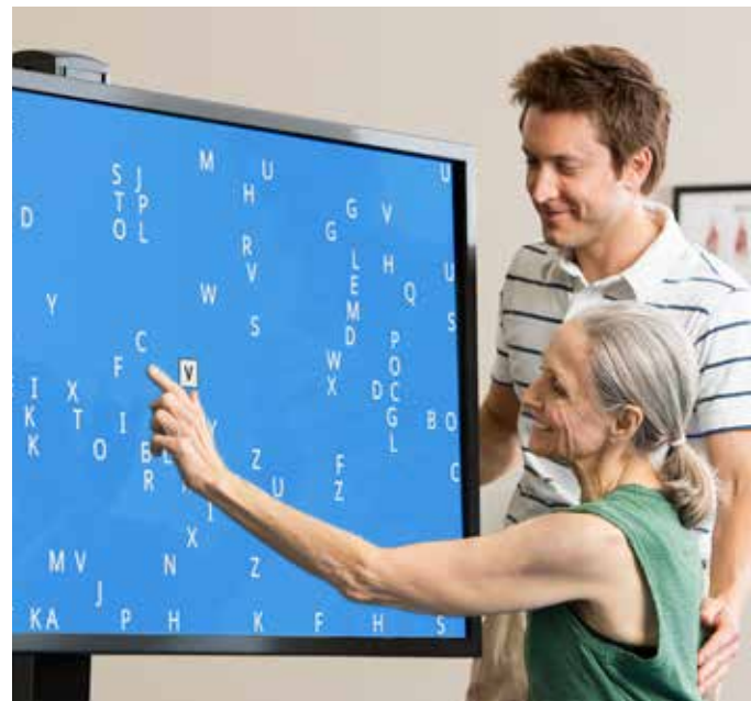
The Integrated Therapy System (BITS3.0), helps patients improve coordination, balance and cognitive issues.