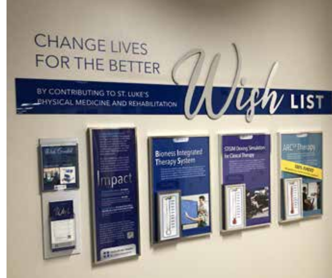
Physical Medicine and Rehabilitation Wish List

Your gift to St. Luke's PM&R Wish List will help patients make great strides on their road to recovery. Donate now at give. unitypoint.org/rehab or call St. Luke's Health Care Foundation at (319) 369-7716.