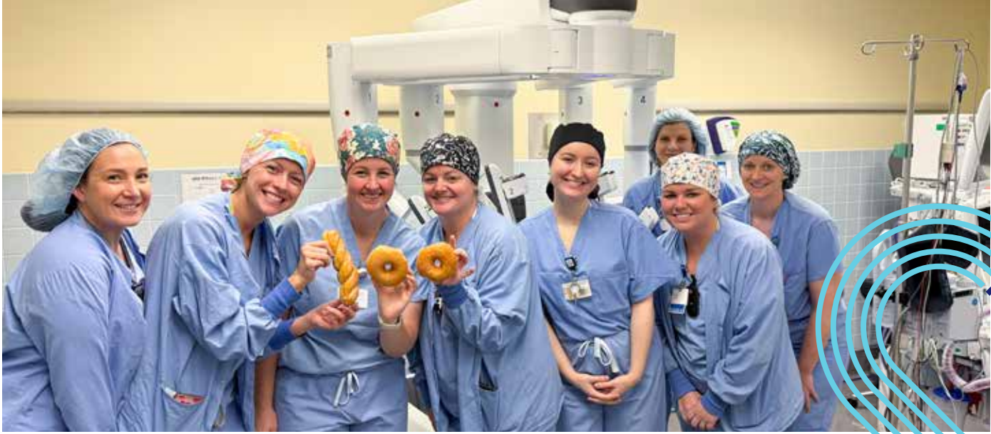
The Surgery and OB/GYN teams celebrated 100 procedures with the da Vinci system.