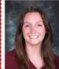
The ROSE Award Raising Our Standards of Excellence