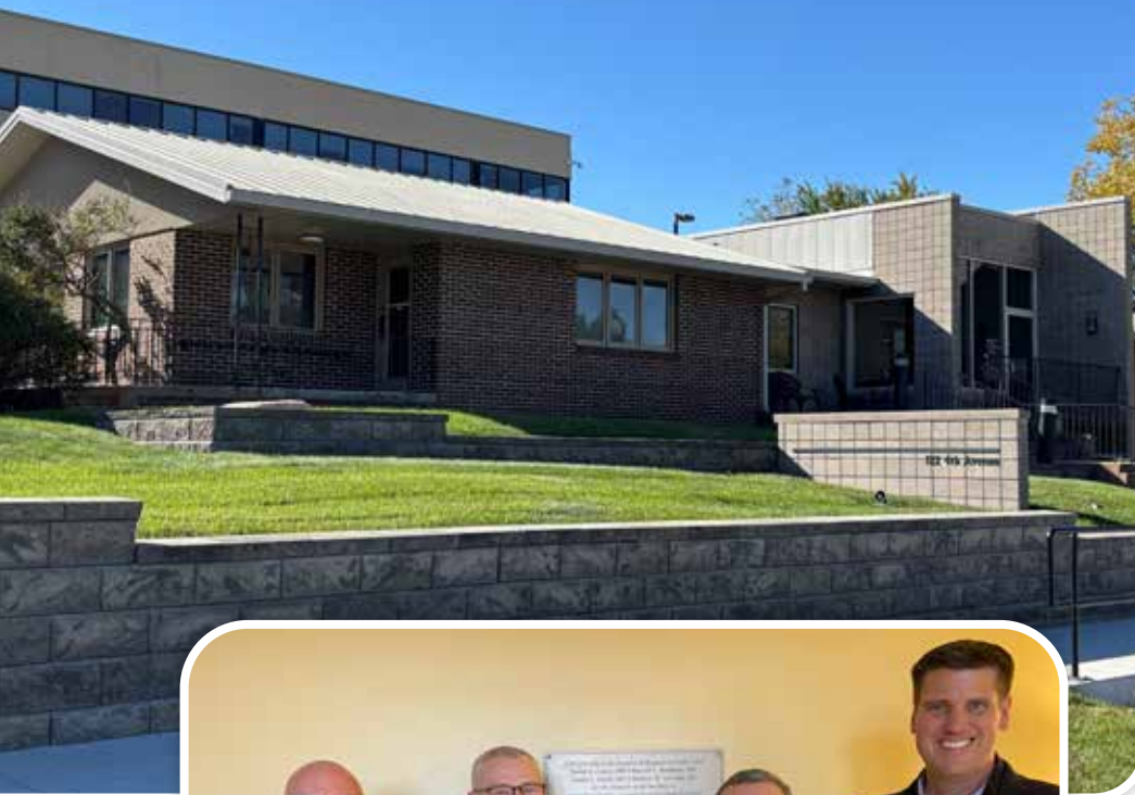
The building at 122 4th Avenue, acquired in 2025.